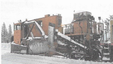
Spreader at Rest