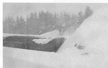
Rotary Blowing Snow